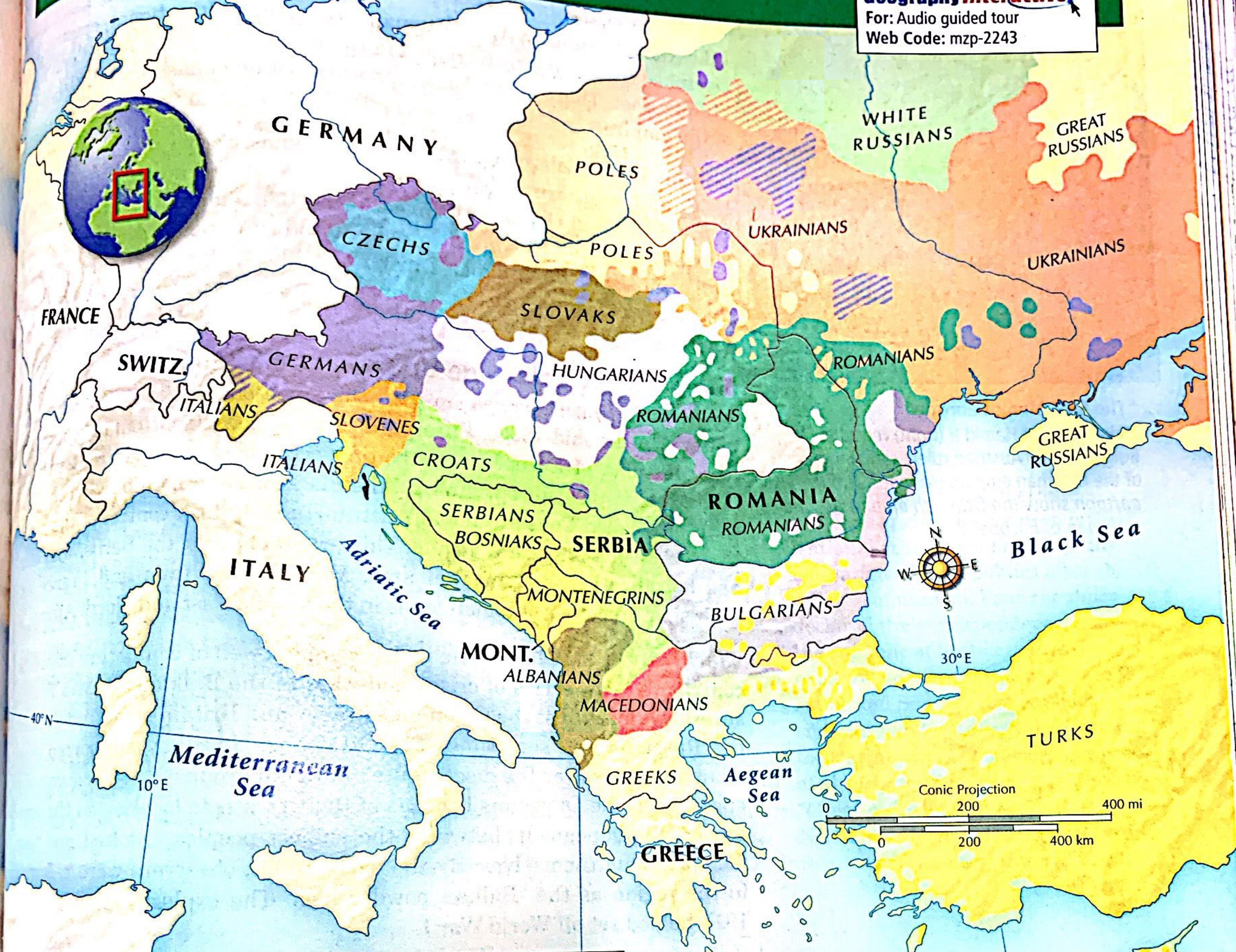
Colors reflect the major languages spoken in Eastern Europe, 1800 to 1914.