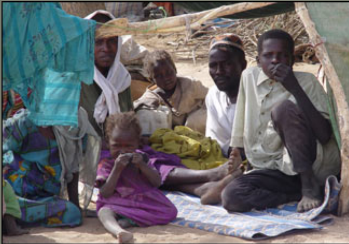
Families fleeing Darfur's ongoing violence improvised makeshift shelters.