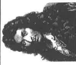
King Louis XIV