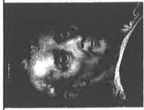
Baron of Montesquieu